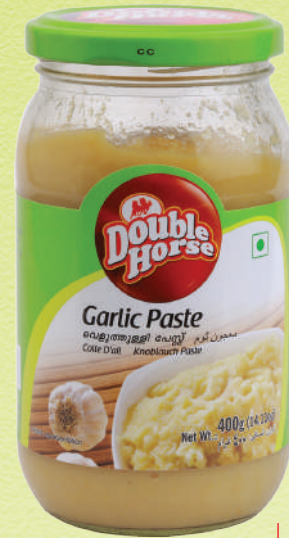
Garlic Paste 400g

No extra effort to add the fine flavour while cooking. Just cut the Garlic, Ginger, Tamarind or Ginger Garlic paste packs and make the dishes more exciting. With no added chemicals or harmful preservatives, they are on the safe side of good health.