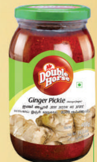
Ginger Pickle 400g