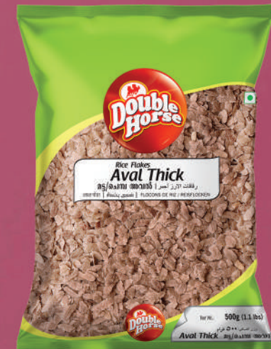
Aval Thick 500g