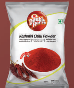
Kashmiri Chilli Powder 250g