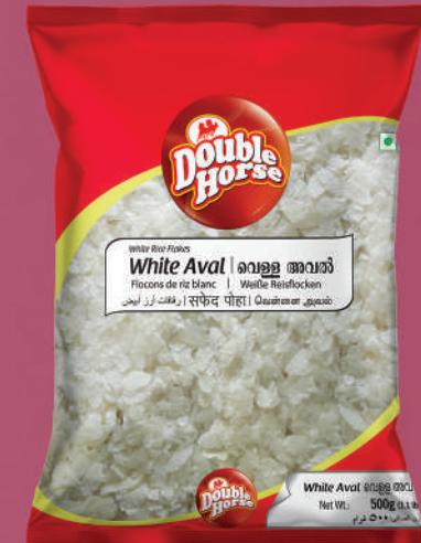
White Aval 500g