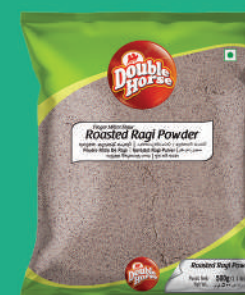
Roasted Ragi Powder 500g, 1kg