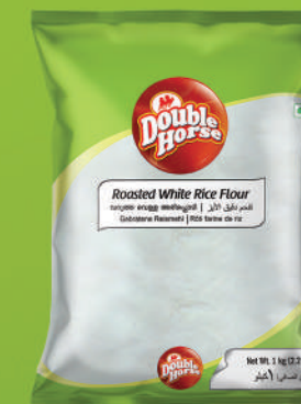
Roasted White Rice Flour 1kg