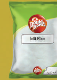
Idli Rice 2kg,5kg,10kg