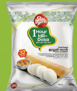
1Hour Idli Dosa Batter Pre-Mix 1kg