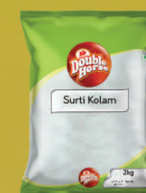
Surti kolam 2kg,5kg