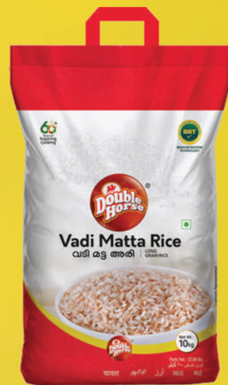
Vadi Matta/Long 2kg, 5kg, 10kg, 20kg