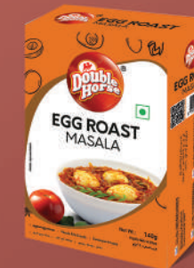
Egg Roast Masala 140g