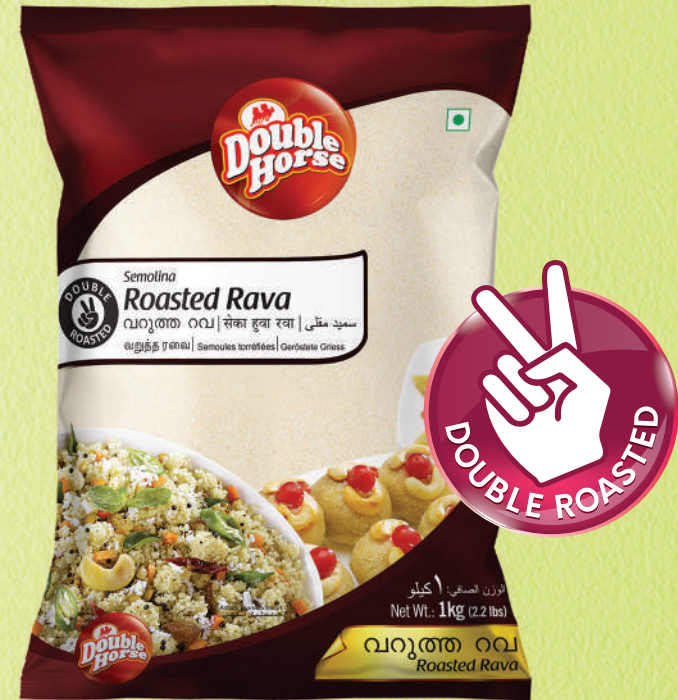
Roasted Rava 500g, 1kg

Unadulterated food can bring the natural taste and the happiness of health as well. That's why Double Horse wheat products become a favourite choice for preparing a variety of wheat dishes. Carefully selected, and precisely made to ensure that irresistible, natural taste.