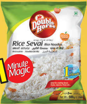
Rice Sevai 200g