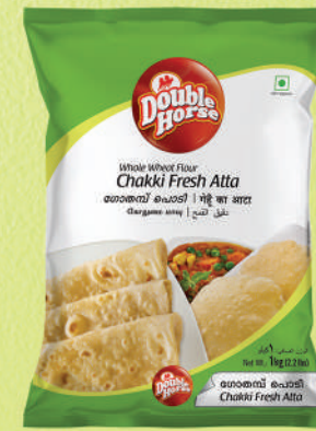
Chakki Fresh Atta 1kg, 2kg, 5kg