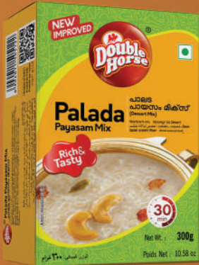
Palada Payasam Mix 300g