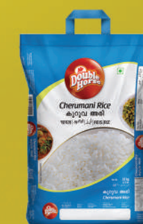
Cherumani Rice 2kg, 5kg, 10kg, 20kg