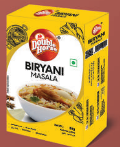
Biryani Masala 80g