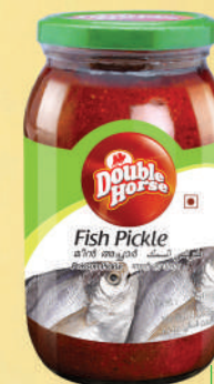
Fish Pickle 400g