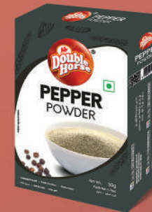
Pepper Powder 50g