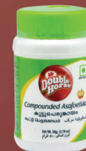
Compounded Asafoetida Powder 50g