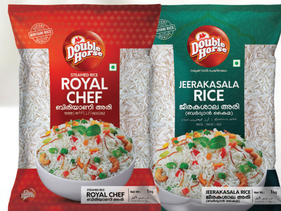
Royal Chef 1kg