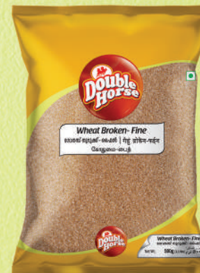
Wheat Broken - Fine 500g