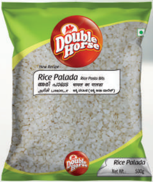
Rice Palada 200g