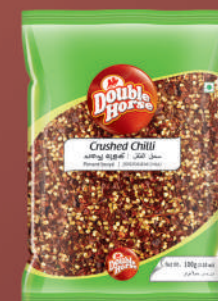
Crushed Chilli 100g