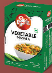
Vegetable Masala 140g