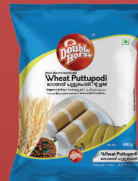
Wheat Puttupodi 500g, 1kg