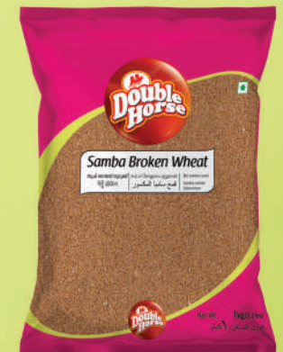
Samba Broken Wheat 500g