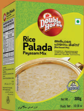
Rice Palada Payasam Mix 300g