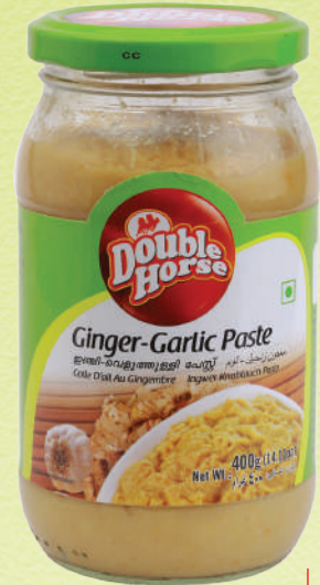
Ginger-Garlic Paste 400g