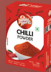
Chilli Powder 140g, 250g, 500g, 1Kg