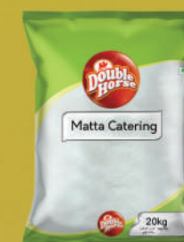
Matta catering 20kg