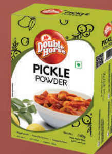
Pickle Powder 140g