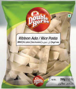
Ribbon Ada/Rice Pasta 200g