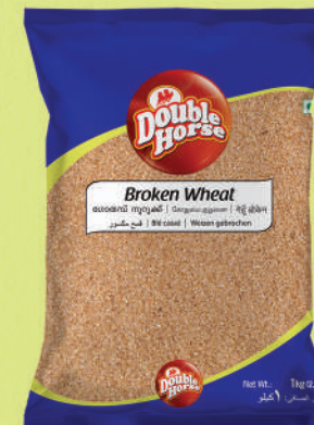
Broken Wheat 500g