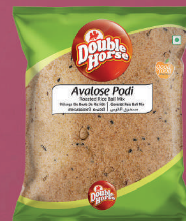
Avalose Podi 500g