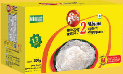
Instant Idiyappam (white) 200g

Double Horse has a variety of products that suit the fast pace of modern living. These products help the new generation prepare those unique traditional Kerala dishes instantly and enjoy the great tastes fully. They are health-friendly too.