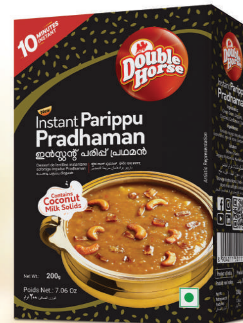
Instant Parippu Pradhaman 200g