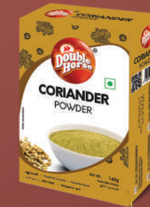
Coriander Powder 140g, 250g, 1Kg