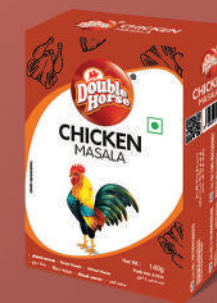
Chicken Masala 140g