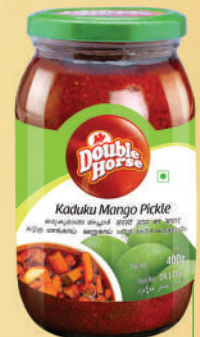
Kaduku Mango Pickle 400g