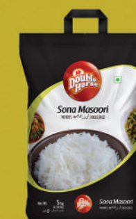
Sona Masoori 5kg, 10kg