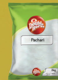
Pachari White Raw Rice 2kg, 5kg