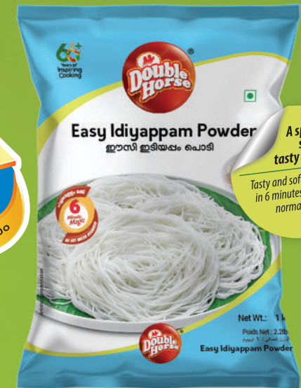
Easy Idiyappam Powder 500g, 1kg