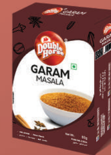
Garam Masala 80g