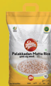
Palakkadan Matta Rice (Unda/short) (Parboiled) 2kg, 5kg, 10kg, 20kg