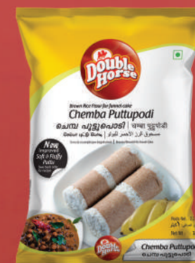
Chemba Puttupodi 500g, 1kg