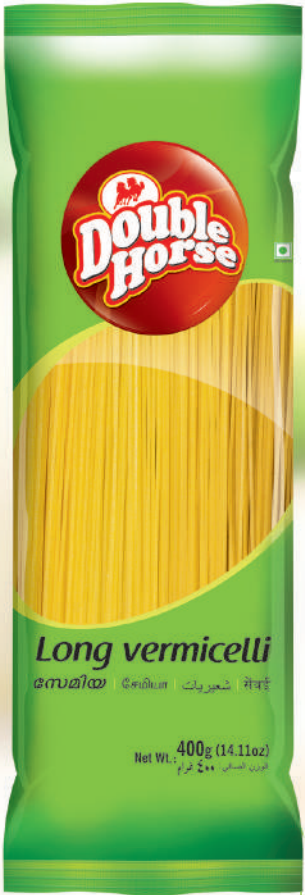
Long Vermicelli 400g