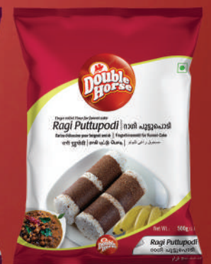
Ragi Puttupodi 500g