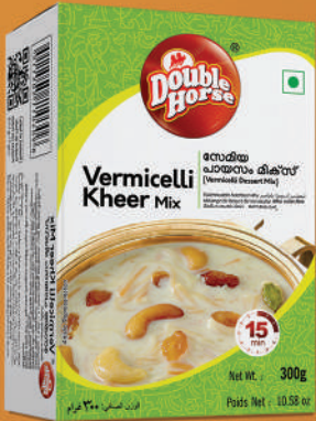
Vermicelli Kheer Mix 300g