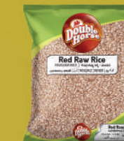
Red Raw Rice (Payasam Rice) 1kg, 50kg