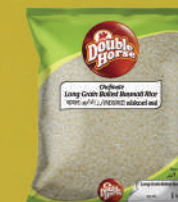
Chefmate Long Grain Boiled Basmati Rice 1kg