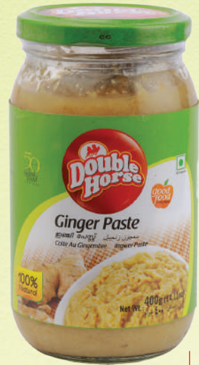
Ginger Paste 400g