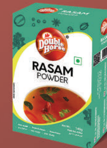
Rasam Powder 140g