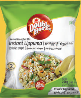
Instant Uppuma 1kg