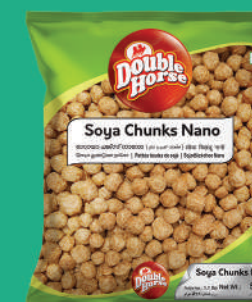
Soya Chunks Nano 200g, 500g