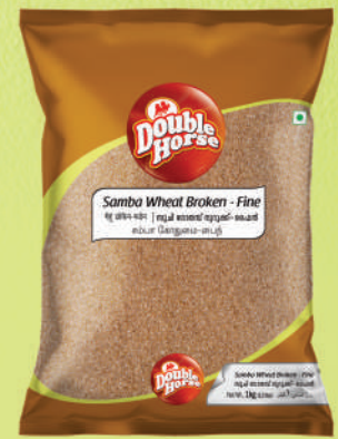
Samba Wheat Broken- Fine 500g