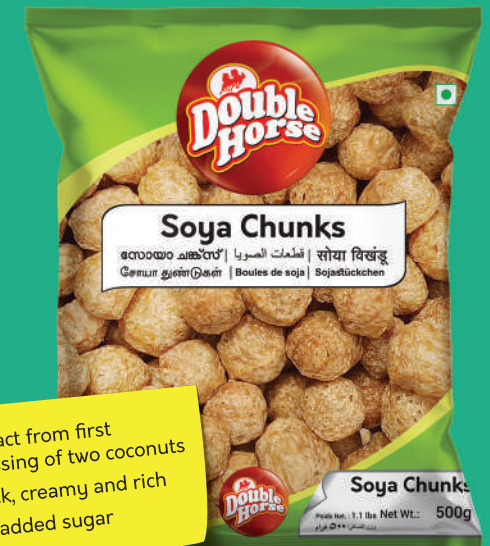
Soya Chunks 200g, 500g

Its essential to consider the healthy and nutritious elements of your daily food. With Double Horse's Ragi, Soya Chunks, Coconut milk etc., you could sample add a pinch of nutrition without losing the lusciousness of what you cook for your loved ones.