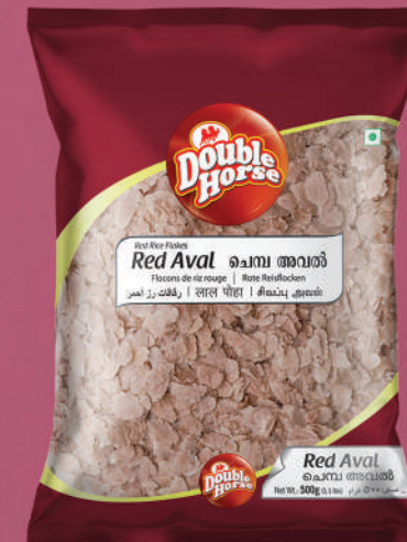
Red Aval 500g