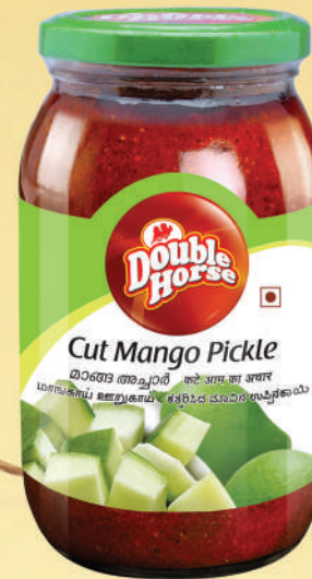
Cut Mango Pickle 400g