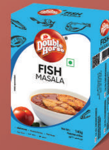
Fish Masala 140g