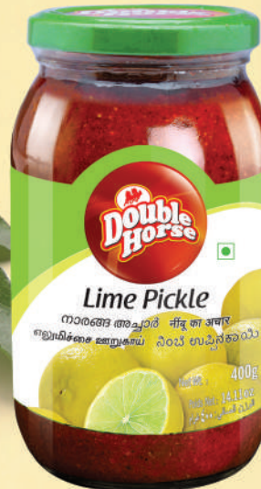
Lime Pickle 400g