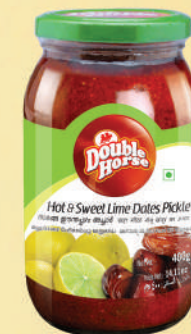
Hot & Sweet Lime Dates Pickle 400g