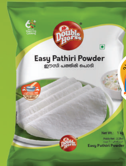
Easy Pathiri Powder 500g, 1kg