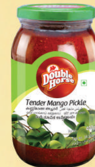
Tender Mango Pickle 400g