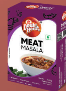
Meat Masala 140g