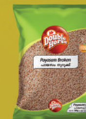
Payasam Rice 1kg