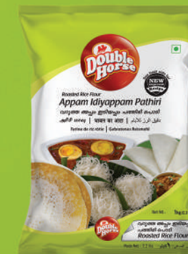
Appam Idiyappam Pathiri 500g, 1kg, 5kg