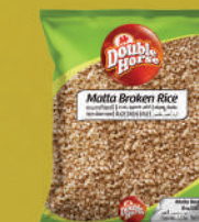
Matta Broken Rice 500g, 1kg