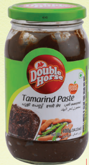
Tamarind Paste 400g