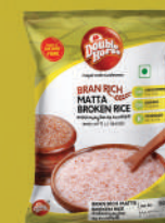
Bran Rich Matta Broken Rice 500g