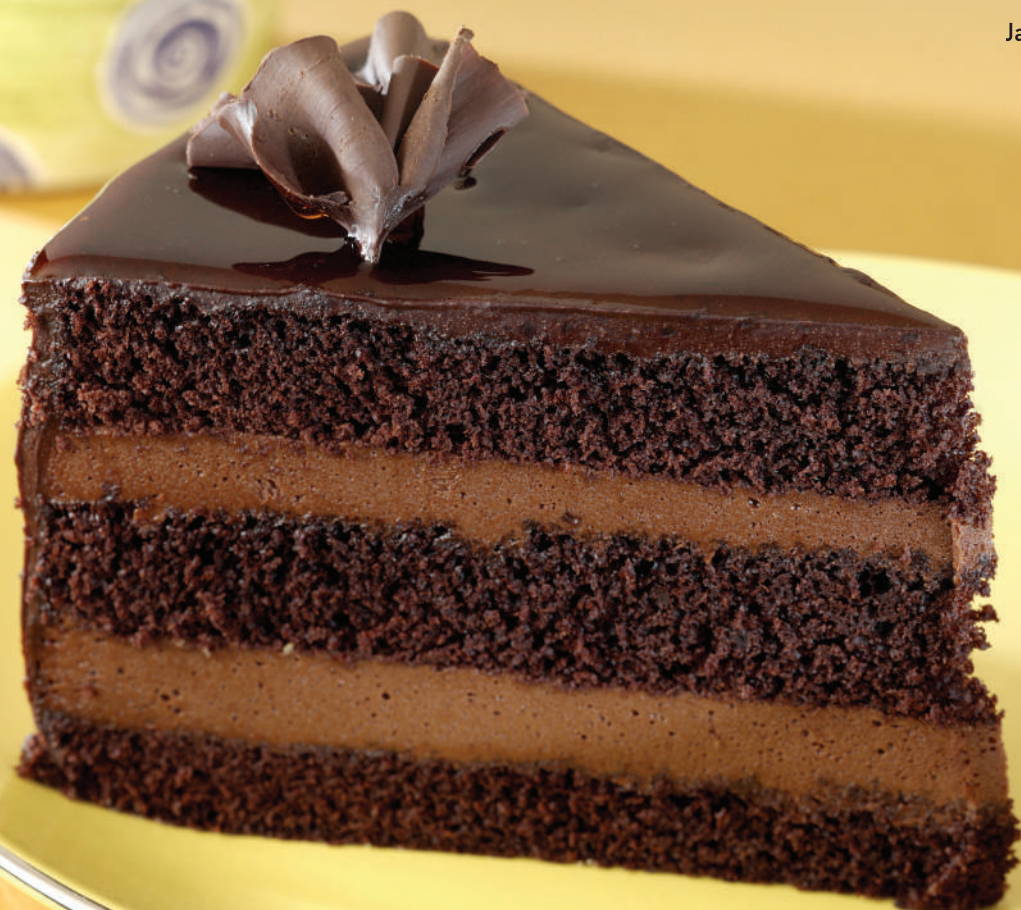
Jaggery Powder 600g