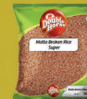
Matta Broken Rice (Super) 500g, 20kg, 50kg