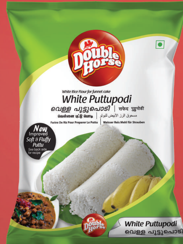
White Puttupodi 500g, 1kg, 5kg