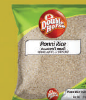
Ponni Rice 2kg, 5kg, 10kg