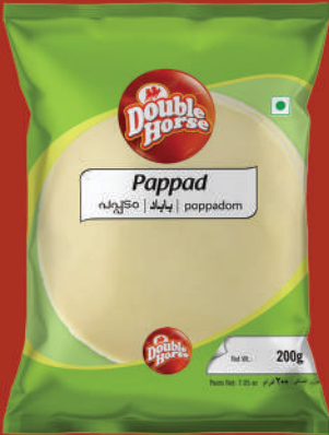
Pappad 100g, 200g