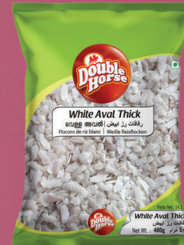
White Aval Thick 400g