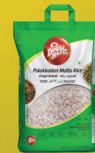
Palakkadan Matta Rice (Single boiled) 5kg, 10kg