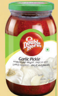
Garlic Pickle 400g