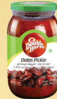
Dates Pickle 400g