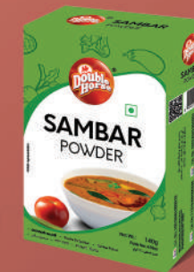
Sambar Powder 140g