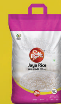
Jaya Rice 2kg, 5kg, 10kg, 20kg