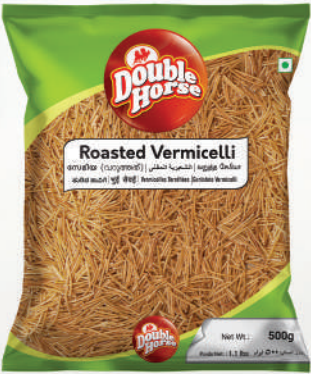
Roasted Vermicelli 200g, 500g, 1kg