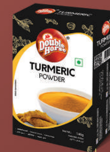
Turmeric Powder 140g, 250g, 1Kg