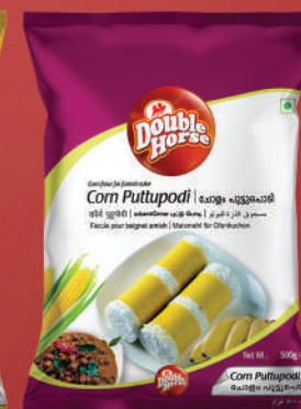
Corn Puttupodi 500g