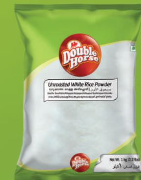
Unroasted White Rice Flour 1kg