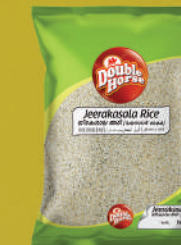
Jeerakasala Rice 2kg, 5kg, 20kg