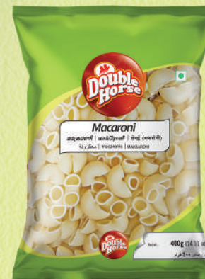
Macaroni 200g, 400g, 800g