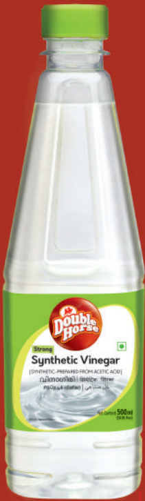
Synthetic Vinegar 500ml, 1L