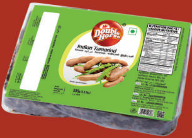
Indian Tamarind 200g, 500g, 1Kg