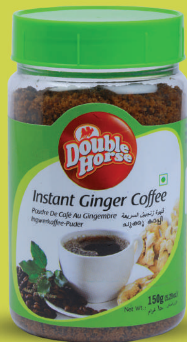
Instant Ginger Coffee 150g

A special category for enhancing health, everyday. The products are suitable for all age groups and can use for preparing a variety of dishes for the whole family, at anytime in a day. It will enrich health in an easy and tasty way.