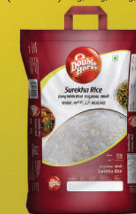
Surekha Rice 2kg, 5kg, 10kg, 20kg