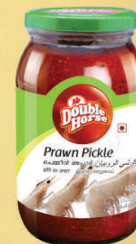
Prawn Pickle 400g